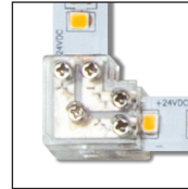
90° Tape to Tape Connector