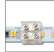
Tape to Tape Connector