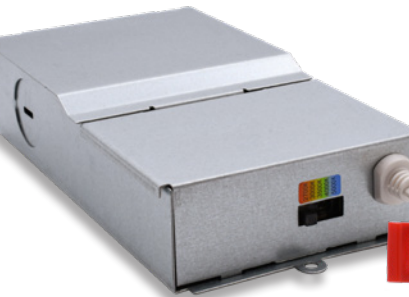
Power supply with integrated junction box