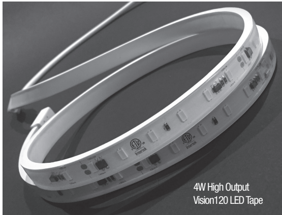
4W High Output Vision120 LED Tape